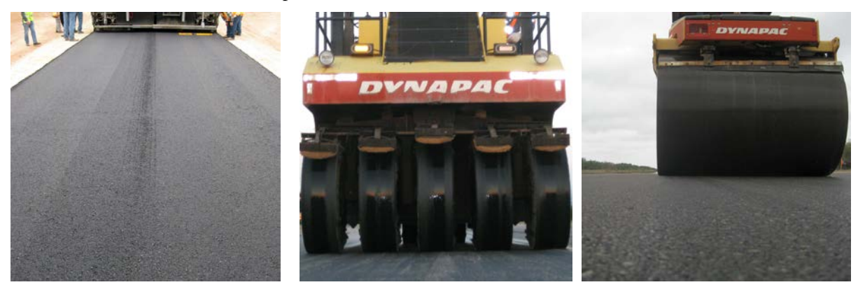
Figure 6 – Streaking from poor paving practice (a) and pneumatic (b) and steel drum (c) compaction

Furthermore, steel drum rollers can be operated in both vibratory and static modes. Steel drum rollers tend to compact through vertical deformation, while pneumatic rollers (with their high inflation pressures) tend to "knead" the asphalt. As a result, both types of rollers will affect the surface texture, but in different ways. There will also be differences in the density near the surface (which strongly correlates to the acoustical absorption).