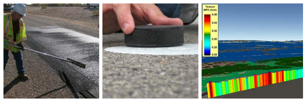
Figure 3 – Constructing undesired texture (a), measuring with sand patch (b), managing pavement texture (c)

Using pavement management methods, sand patch and other test data can be used along with pavement engineering models to monitor the performance of the ISO test track. With these capabilities, it is possible to predict the date that reconstruction of the ISO 10844 surface may be necessary. Furthermore, through modern visualization tools within pavement management systems, the source of the deterioration can be more readily determined [22] (see Figure 3c). It is particularly helpful when construction quality data is layered into the same management system.