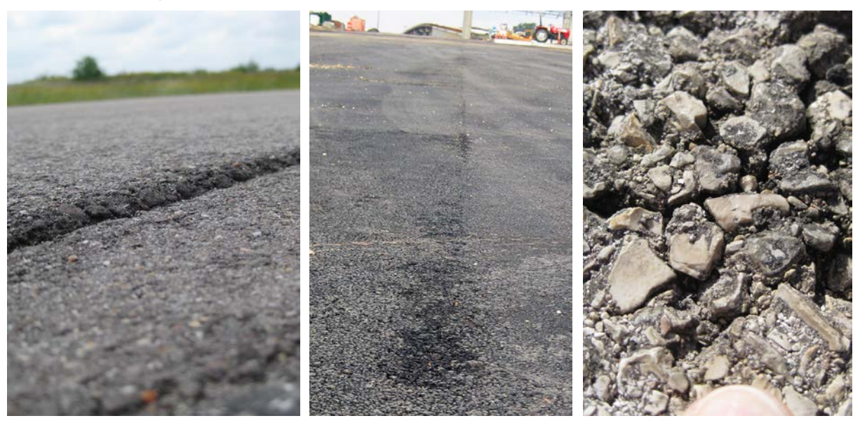
Figure 1 – Poor joint construction (a,b) and deteriorated asphalt material (c)

3. Means to minimize segregation of the asphalt material. Segregation can lead to a non-uniform texture (see Figure 2). The ISO 10844:2011 standard includes new provisions for "homogeneity" that are of particular relevance. Numerous factors affect segregation, and thus a constructability review must include the means of production, transport, and paving.