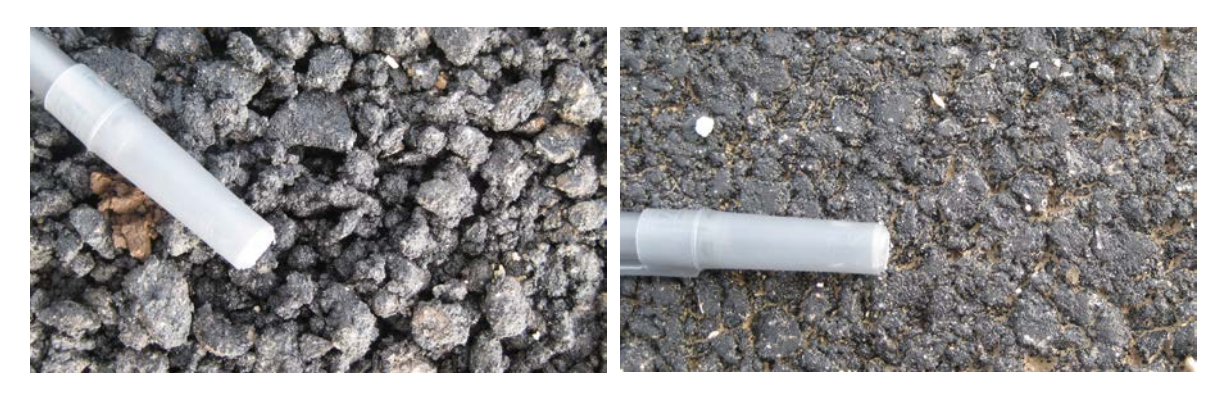
Figure 2 – Segregated asphalt can lead to coarse texture (a) within a meter of fine texture (b)

raking loose asphalt material from the joints across the mat (before compacting) is a common practice in asphalt paving (see Figure 3a). However, on ISO 10844 surfaces, this practice can have potentially detrimental consequences to both texture and acoustical absorption.