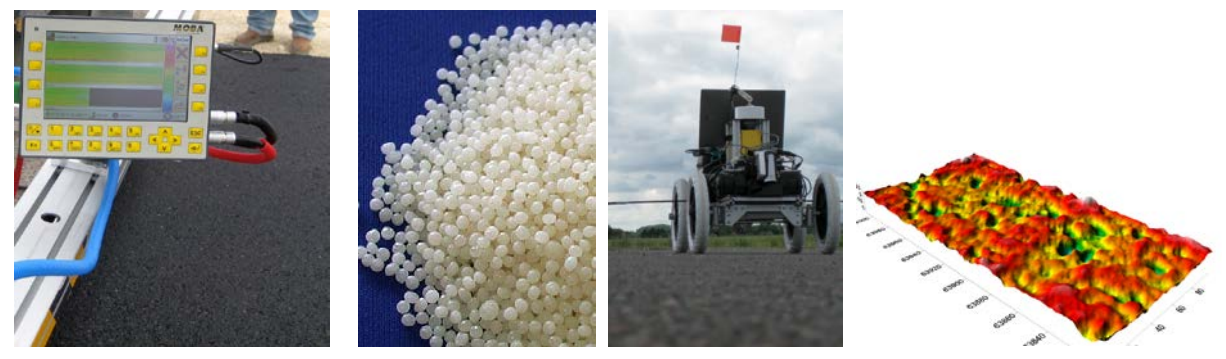
Figure 7 – Innovative technologies to improve pavement quality

Measurement technologies such as the RoboTex profiler allow for three-dimensional texture profiles to be measured along both the length and width of the ISO 10844 paving surface [14-16] (see Figures 7c and 7d). With these data, texture depth (MPD) can be calculated and reported with a resolution capable of linking it to changes in rolling pattern, weather (wind speed, in particular), and a multitude of other factors that can impart "construction artifacts". Conventional texture profilers are not capable of producing the same density of texture data, and are thus of limited benefit in this regard.